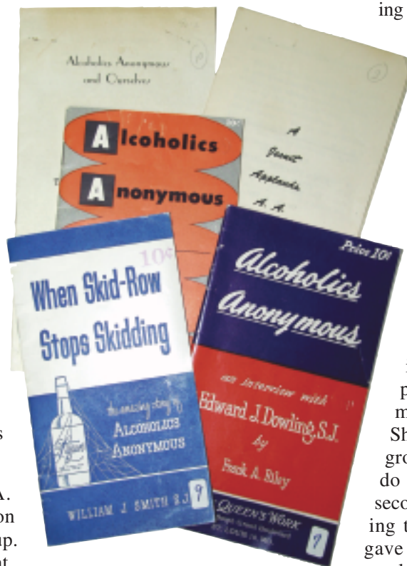
Examples of publications on alcoholism by the clergy.