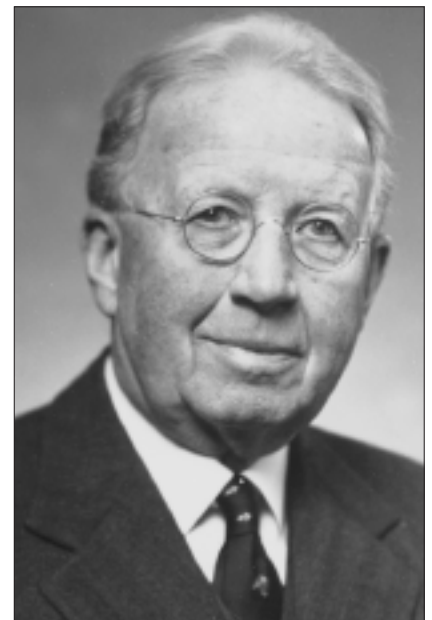
Dr. Harry Emerson Fosdick (1878-1969) of Riverside Church in New York City did Alcoholics Anonymous a great service with his early support.

He went on to say that, "I ... recommend all rabbis, priests, and ministers to acquaint themselves with this movement, avail themselves of its help, and encourage the groups that may be forming in their community."