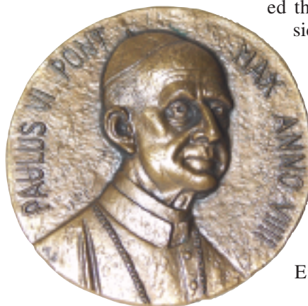
Medallion of the Good Shepherd presented to representatives of A.A. by Pope Paul VI in January 1972.