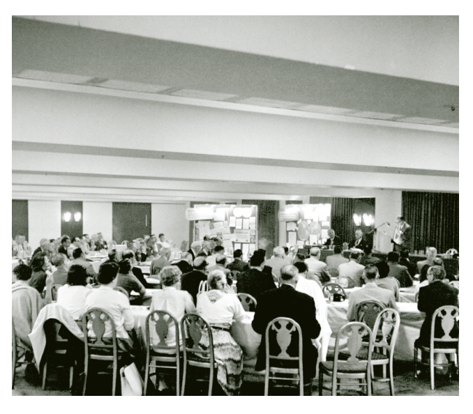
A session of the 1955 General Service Conference, held at Hotel Jefferson, St. Louis, Missouri. This Conference was a part of the International Convention and the only Conference held outside of New York State. The second edition of the Big Book was introduced and the Third Legacy of Service was accepted.

Alcoholic With Special Needs" will be reviewed by the Treatment Facilities/Special Needs-Accessibilities Committee.