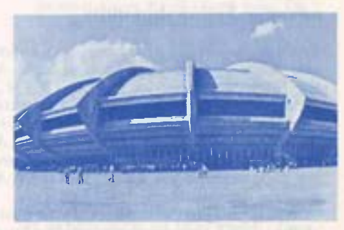
For Big Meetings at the 1985 Convention, the stadium in Montreal's Olympic Park could seat from 60,000 to 80,000-nothing like aiming high! The Convention Center (Palais des Congrès) is offered as headquarters for the half-century celebration.

The 130 Conference members took a hard look at their own committee system, Regional Forums, proposals for new literature, and many other issues suggested by A.A.'s all