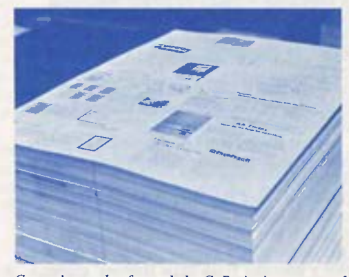
Grapevine order forms help GvRs invite more and more A.A.'s to our monthly meeting in print.

Staff report: As if foreseeing the 1981 Con-