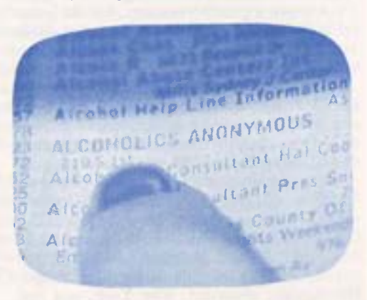
P.I. TV spots offer this recourse to alcoholics.

Staff report: We now have 517 P.I. committees, 527 P.I. contacts, and 424 others on our mailing list. Most of the P.I.-C.P.C. Bulletin material comes from correspondence on their activities.