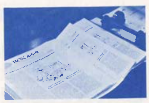
Box 4-5-9 emerges from the cutting machine at RCH, New York plant that handles typesetting, production of mechanicals and negatives, printing, and mailing for many bulletins and service items.

Staff report: The service coordinator supervises production of all service material, updating of Guidelines and lists, new Group Handbooks, literature displays, G.S.R. Kits,