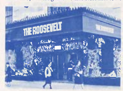
Reports condensed on these pages were prepared for Conference members meeting at this hotel.

Staff report: This assignment involves preparation, production, editorial supervision, and distribution of publications and audiovisual materials, working with other staff members