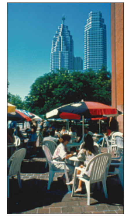
Front and Wellington Streets, Toronto.

While the major meetings are highlights of the program, each day