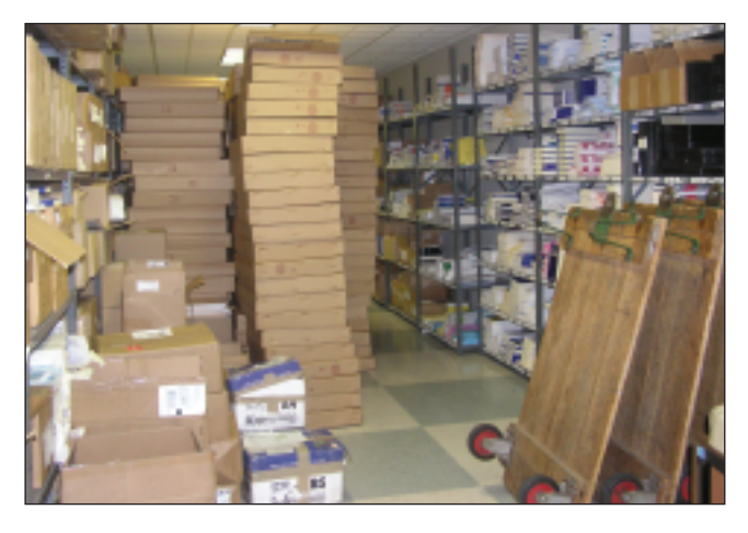
A fresh delivery of material sits piled high in the mailroom. To the right, along the wall, some of the shelving holding foreign literature can be seen.

Today's mailroom staff is the smallest in decades, just five veteran (nonalcoholic) employees, each with over 20 years of tenure. They work in a large room crammed with the books, pamphlets, videos, tapes, and myriad other material of the A.A. program.