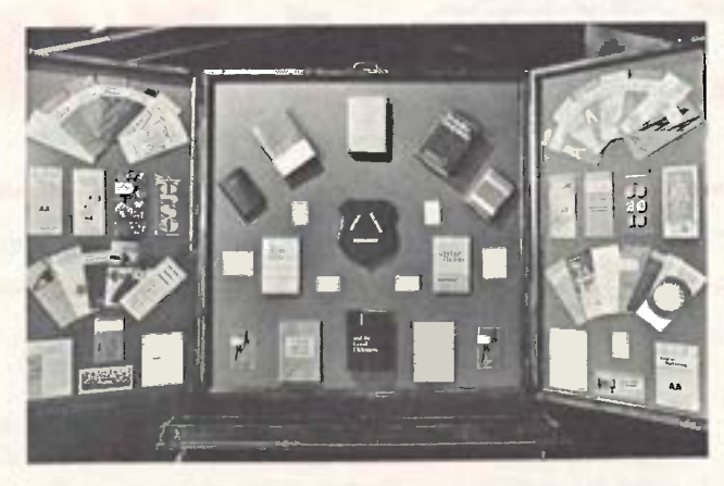
This convention and meeting display, designed by the Central Delaware Intergroup contains the latest A.A. literature. It folds up into a handy carrying case that also rolls out to your car.

excerpt "How It Works" are for everyone!