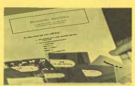
If you're getting ready to lead a beginners meeting, you'll find in this kit a leaflet of good ideas, plus pamphlets useful in answering common questions.

"But official recognition from the whole Medical Society is still a very heartwarming and valued thing to receive," Bob wrote.