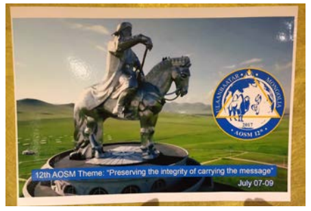
Signage at the 2017 Asia-Oceania Service Meeting in Ulaanbaatar, Mongolia.

Regarding how to help new and fledgling groups understand A.A.'s Seventh Tradition of self-support, several delegates at a W.S.M. said their countries were trying to focus not so much on the financial aspects of group participation but, rather, on getting the members to express their support and involvement in the work that the service structure does on the groups' behalf. They found that when there was a sense of involvement and participation, the funds usually would follow, whereas focusing on the monetary aspect alone was less effective over the long run.