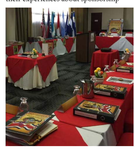
Tables set for the 2017 REDELA in San Jose, Costa Rica.

Zonal meetings, which take place the year in between W.S.M.s, maintain continuity between meetings and offer help to A.A.s where no structure has been set up. Held in alternate years in cities around the world, these events provide forums for countries to share their experiences about sponsorship