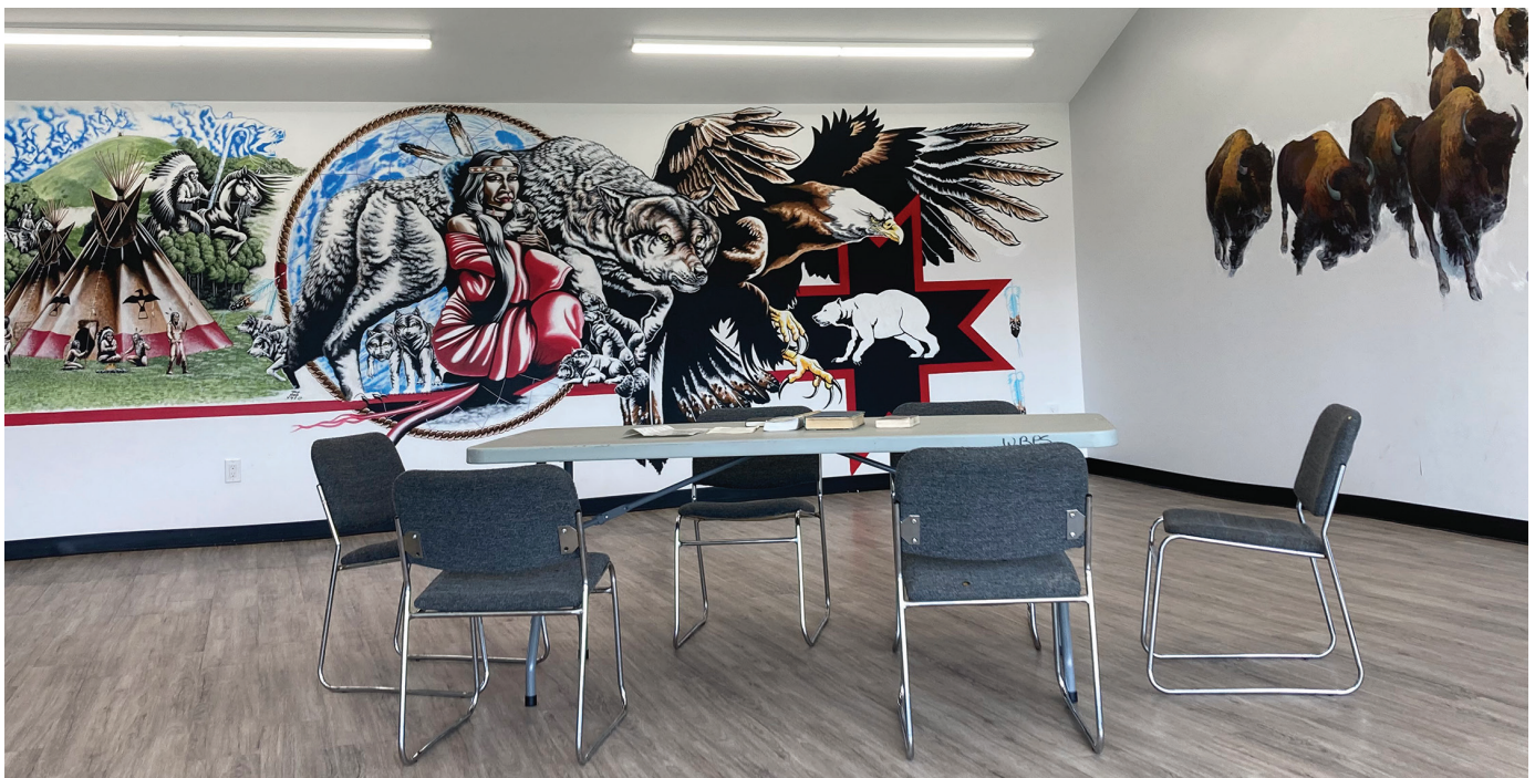
The White Bear Last Stand group meets in this spiritual room — the White Bear Wolves Den — from fall to spring.

Isolated efforts toward translation undertaken by local communities have been made over the years, but more work and attention are needed to make materials more accessible to communities of indigenous speakers. One such source was a box of materials in a variety of