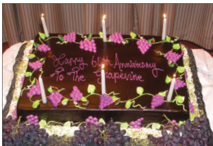
The 60th anniversary of the Grapevine was celebrated this past April at the General Service Conference in New York. The month also saw the debut of the online Digital Archive of the magazine.

In 1946, the Grapevine was legally incorporated as one of two service corporations of A.A.'s General Service Board. In a letter to the lawyer who drafted the articles of incorporation, Bill W. described his vision for the magazine and articulated some key editorial principles: "The Grapevine staff should be primarily responsive to A.A. group opinion and tradition. . . . The Grapevine should feel free to print articles expressing the widest dif-