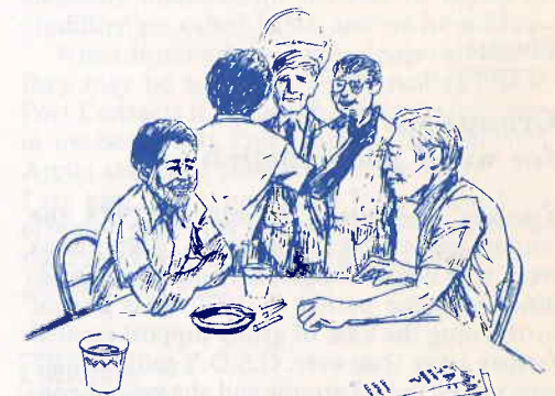
Preliminary sketch of prison A.A. group

Staff, committee, and board members have participated in events including: 1978 Annual Forum of National Council on Alcoholism; Summer School of Alcohol Studies, Rutgers University; Summer School of Alcohol Studies, University of Utah; meetings of Advisory Council, National Institute on Alcohol Abuse and Alcoholism; National Association of Alcoholism Counselors' Conference; 32nd International Congress on Alcoholism and Drug Dependence; 29th Annual Meeting of Alcohol and Drug Problems Association of North America; Conference on National Standards for Drinking Driving Cases; Mid-Atlantic Seminar on Alcoholism; Third South-eastern Conference on Alcohol and Drug Abuse.