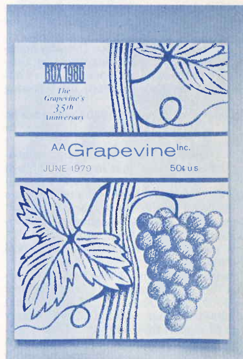
Poster used in Conference Grapevine display