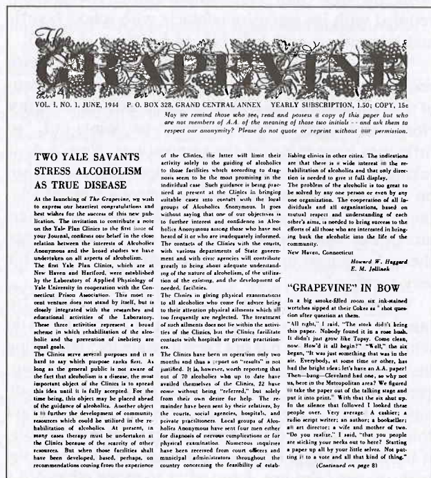
Facsimile copy of the first issue. Available from the Grapevine, $1.50.

In Moscow, the visitors attended a meeting of the one A.A. group, the Moscow Beginners Group: "It was conducted in the traditional A.A. way, with the Preamble, Steps and Traditions read at the beginning of the meeting. After much sharing, we closed with the Serenity Prayer. Tea and fellowship followed. The approximately 30 group members, whose length of sobriety