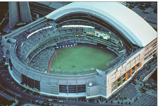
SkyDome Stadium, where the big meetings will be held.

We know that some members may feel discouraged by the need to address the process necessary to travel into Canada—or any future International Convention in North America. We understand, yet we also know that sobriety provides opportunities to become responsible through working the Twelve Steps, and applying A.A. principles in our daily living. One of those principles is that we respect and abide by the law. We are all familiar with the need to adhere to immigration rules and regulations, some of which have been strengthened since