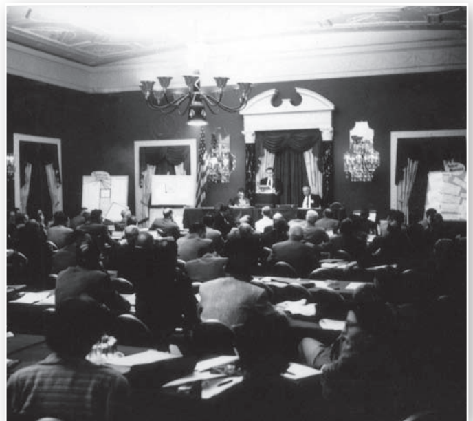
A general session of the 1954 General Service Conference, which met at the Commodore Hotel in New York. This was the last of the four trial Conferences testing whether Bill’s idea for such an annual meeting was viable.

As Bill said in his speech in Chicago, “some may still say,