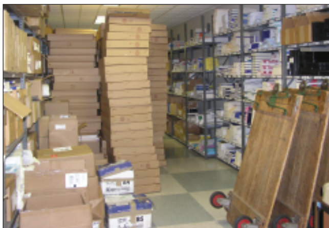
A fresh delivery of material sits piled high in the mailroom. To the right, along the wall, some of the shelving holding foreign literature can be seen.

Today's mailroom staff is the smallest in decades, just five veteran (nonalcoholic) employees, each with over 20 years of tenure. They work in a large room crammed with the books, pamphlets, videos, tapes, and myriad other material of the A.A. program.