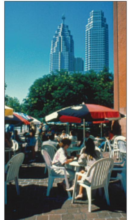
Front and Wellington Streets, Toronto.

While the major meetings are highlights of the program, each day