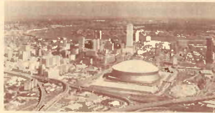
The Superdome (foreground) will be the center of activities at the 1980 Convention.

This September, all A.A. groups will receive registration forms for A.A.'s 45th Anniversary International Convention in New Orleans, La. The theme will be "The Joy of Living," and chief honored guest will be Lois W., widow of A.A. co-founder Bill W.