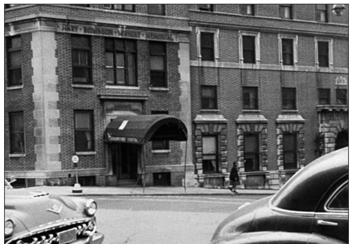
New York’s Knickerbocker Hospital, in an unprecedented experiment for a general hospital in 1945, was accepting alcoholic patients for treatment. By 1954, 10,000 alcoholics, referred by New York Intergroup, had passed through its alcoholic ward.