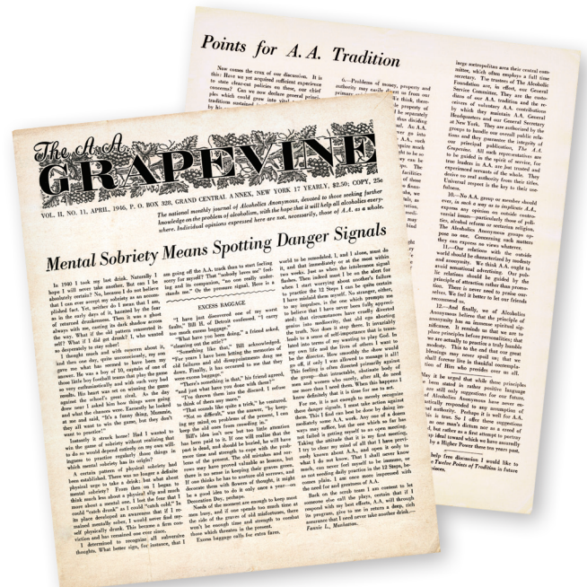
The Twelve Traditions, which came out of the problems that A.A. groups wrestled with in the first 10 years of Alcoholics Anonymous, were first published in the April 1946 issue of the Grapevine. The first page of that issue and the page on which the article about the Traditions was printed are shown here.

In that same letter, which he was writing in response to a local A.A. dispute, Bill refrained from taking sides or issu-