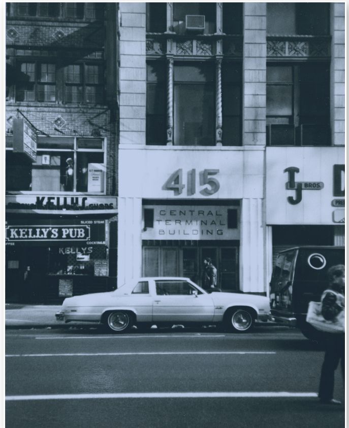
A.A. members around the country saw Bill W. as the ultimate authority on all matters pertaining to Alcoholics Anonymous and would appeal to him for guidance and support. They sent their letters to the Alcoholic Foundation's offices at this building on Lexington Avenue in New York City.

Markings invites its readers to contribute articles for possible publication in the newsletter. A history of an area or a group can be the subject of an article. Markings particularly welcomes stories from A.A. archivists. Share your experiences with us, your successes, and those issues that make your job a challenge. Among our readers are A.A. archivists new to that role and the accounts of those with more experience can be valuable.