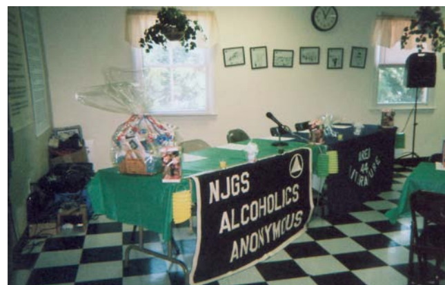
The door prize, on the speakers' table at the Spanish Literature Workshop, was a basket filled with A.A. literature.

Also attending was a representative from the AA Grapevine, who spoke about the magazine and about La Viña , the Spanish-language magazine. "After the end of the day a lot of members noticed that at the workshop we had together the two Spanish intergroups in New Jersey,