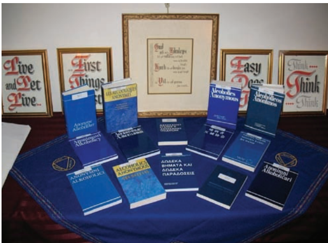
The display of Big Books, in various languages, grew slowly, but has demonstrated that the message of recovery translates well.

A few other members of the group with plans to travel or relocate overseas asked whether Big Books could be purchased on their behalf. One at a time, foreign language Big Books were added and the display grew.