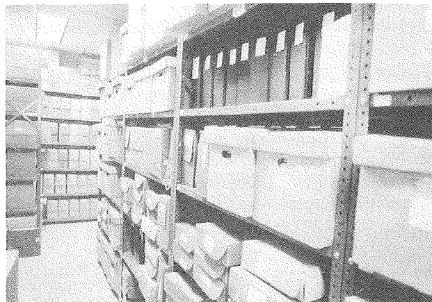
The Archives’ temperature- and humidity-controlled storeroom houses hundreds of acid-free cartons of early correspondence, pamphlet, book manuscripts and audio tapes of our co-founders on 600 feet of shelving.

Materials are acquired from a variety of sources, chiefly from individuals and personal collections. Recent acquisitions include a group of articles on A.A. in Ireland, six tapes of the 1955 St. Louis Convention, a 1939 magazine article on the Oxford Group, a first edition third printing of the Big Book, two original long-playing recordings of Bill W. and Dr. Bob at the 1950 “Big Meeting,” and a book called Vermont in the World War 1917-1919 , in which a reference can be found to Bill W.’s military service.