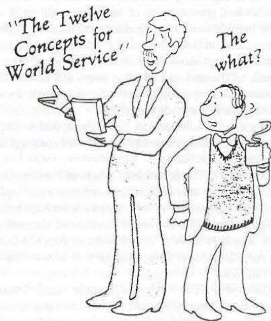
From the pamphlet, "The Twelve Concepts for World Service Illustrated."

G.S.R.s, through the area assembly, elect an area delegate to represent the groups at the annual General Service Conference, which convenes every April in New York. G.S.R.s inform the delegate of the area's group conscience, and the delegate passes it along to the Conference. A delegate's primary concern at all times is for the overall good of A.A. as a whole. The duties of that trusted servant are many, and G.S.R.s and district committee members (D.C.M.s) lend their active assistance throughout the delegate's two-year term. At all