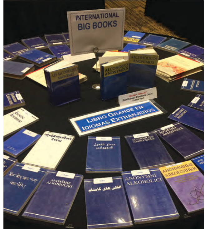
The Big Book is translated into 69 different languages and the foreign literature display at Regional Forums provides tangible evidence of how far the Fellowship can reach.

A Forum program usually consists of presentations on the roles of Class A (nonalcoholic) trustees, Class B (alcoholic) trustees, A.A.W.S. and A.A. Grapevine and La Viña,