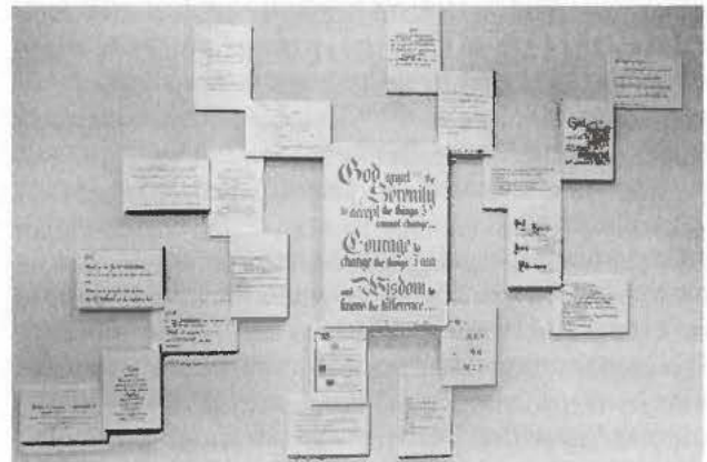
This display, in the reception area at G.S.O., presents the Serenity Prayer in 21 languages.

Dr. Niebuhr was quite accurate in suggesting that the prayer may have been "spooking around" for centuries. "No one can tell for sure who first wrote the Serenity Prayer," writes Bill in A.A. Comes of Age . "Some say it came from the early Greeks; others think it was from the pen of an anonymous English poet; still others claim it was written by an American Naval officer. . . ." Other attributions have gone as far afield as ancient Sanskrit texts, Aristotle, St. Augustine, St. Thomas Aquinas and Spinoza. One A.A. member came across the Roman philosopher Cicero's Six Mistakes of Man, one of which reads: "The tendency to worry about things