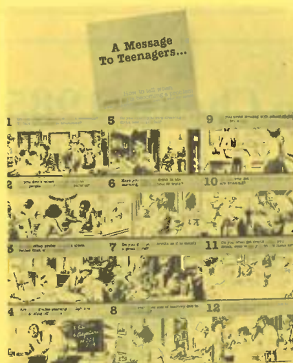
"A Message to Teenagers . . ." above is opened out to show series of cartoon depictions of teenage alcoholics.

of this flyer is that it can be distributed free, and therefore in greater numbers, to teenagers. A.A.'s who give P.I. talks in schools may find it especially useful.